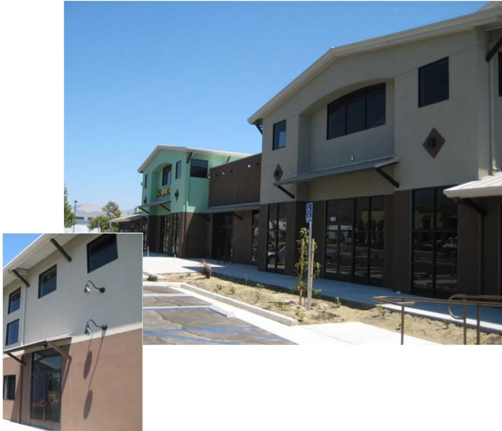
Tank Farm Design Center San Luis Obispo, California